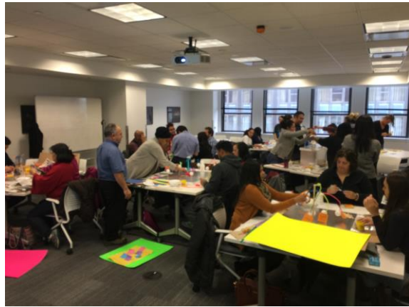
Twenty-six community members attended the meeting and did the metaphorming activity.