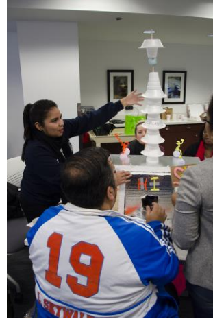
Brighton Park Neighborhood Council working along with Enlace Chicago and others constructing their vision for their organization that has consistent and high quality programs.