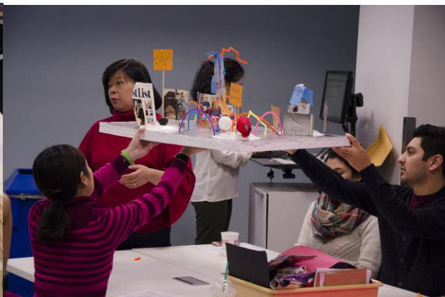
Each group developed a model representing their vision of how a Community Center should run to have a positive and effective impact through their programs.